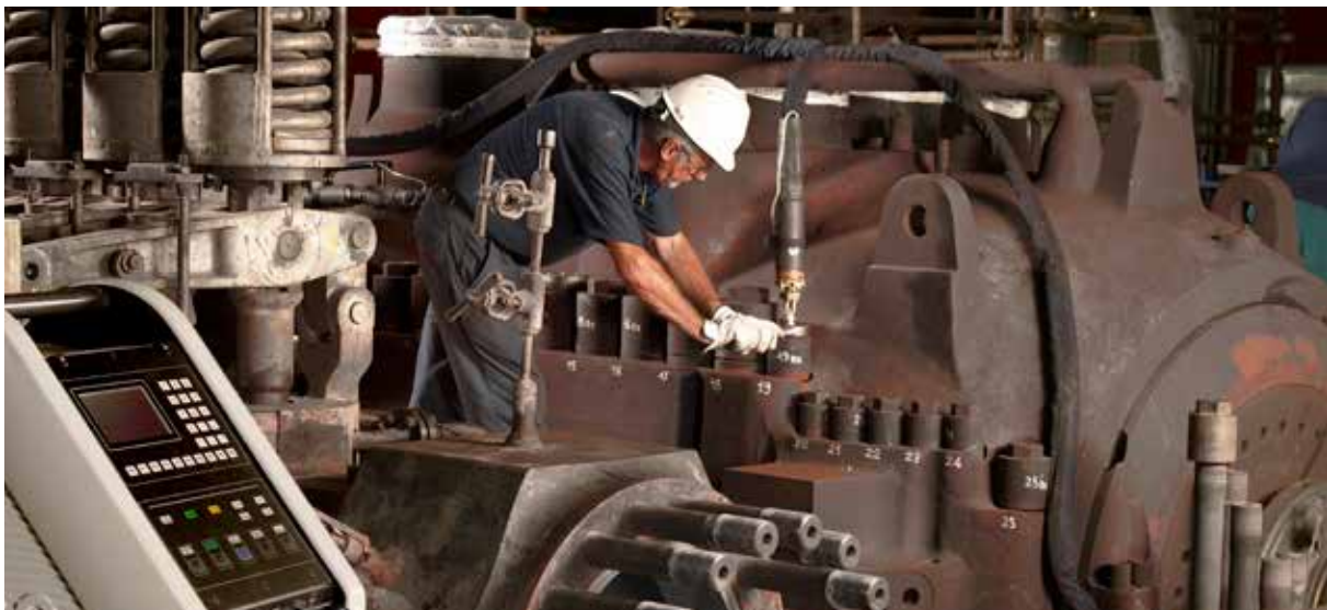
An EFD Induction Minac 25/40 Twin heating bolts on a steam turbine. This particular model features two independent handheld transformers, both powered by one compact and maneuverable converter.

With induction, crucial process parameters such as temperatures, ramp-up and dwell times are set in advance. Operator productivity is enhanced by quick-release coils. It takes only a few seconds to attach differently sized and shaped coils to the handheld transformers. The coils can be used with angle adapters to ensure smooth and fast passage of the coil into the bolt.