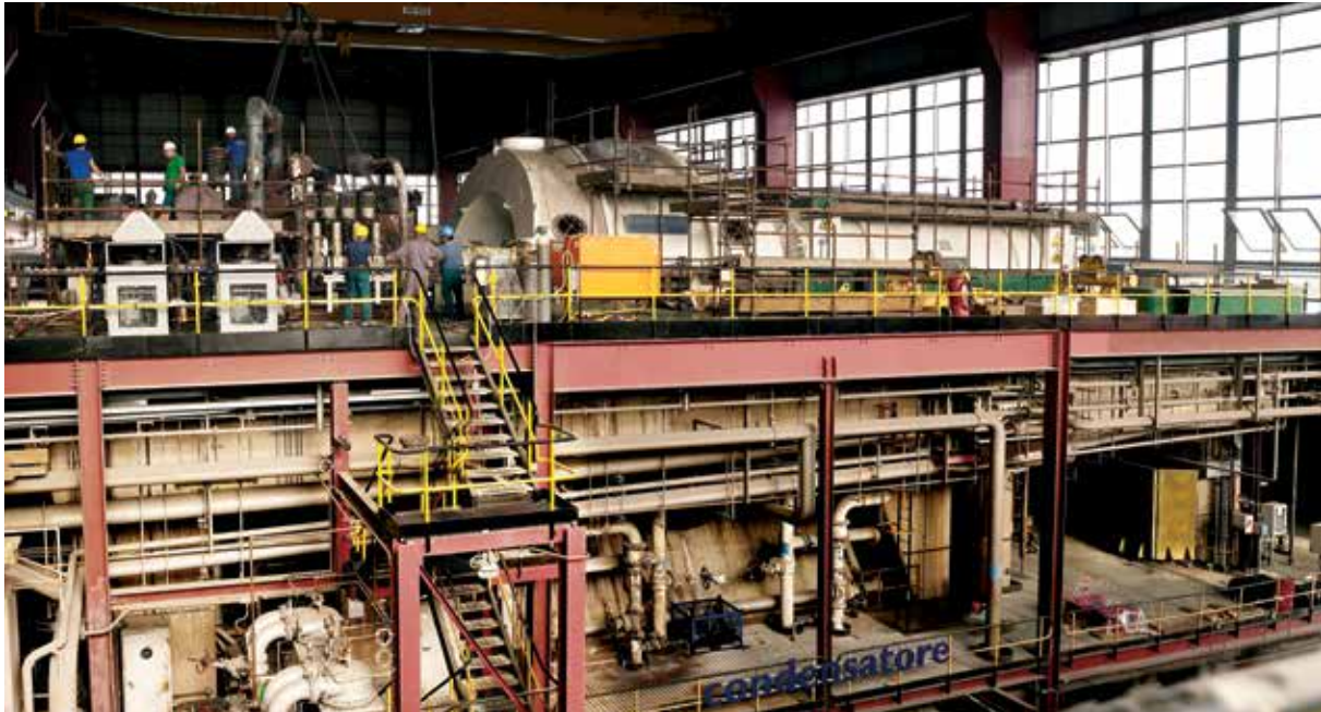
The end result of quick and safe induction bolt heating: an exposed turbine is ready for maintenance.

The Minac also features micro-controllers to ensure optimal heating process control. And process parameters can be fed back to a recording device so you can keep a log of work performed on each bolt.