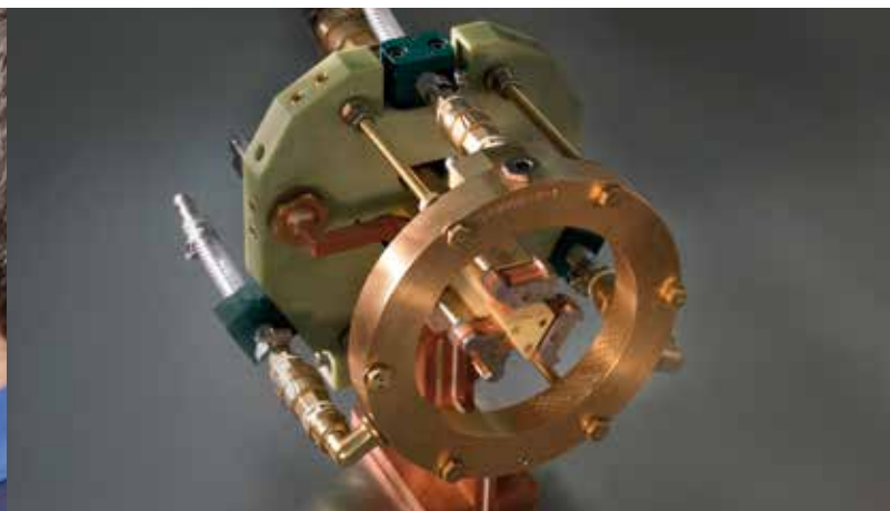
Inductor for surface hardening of tripods. The inductor head is equipped with magnetic flux controllers, main quench and screen quenches.