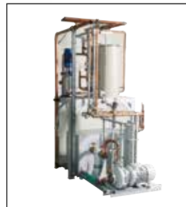
Cooling and quench system