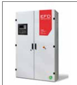
Sinac Heat Generator

Developing customized hardening solutions is an EFD Induction specialty. In fact, custom-engineered systems account for almost half of our hardening machines. Areas of particular expertise are the design and production of laser hardening and drum (Trunion) systems. We also design and supply in-line transfer and conveyor systems for complex components with multiple hardening and tempering zones.