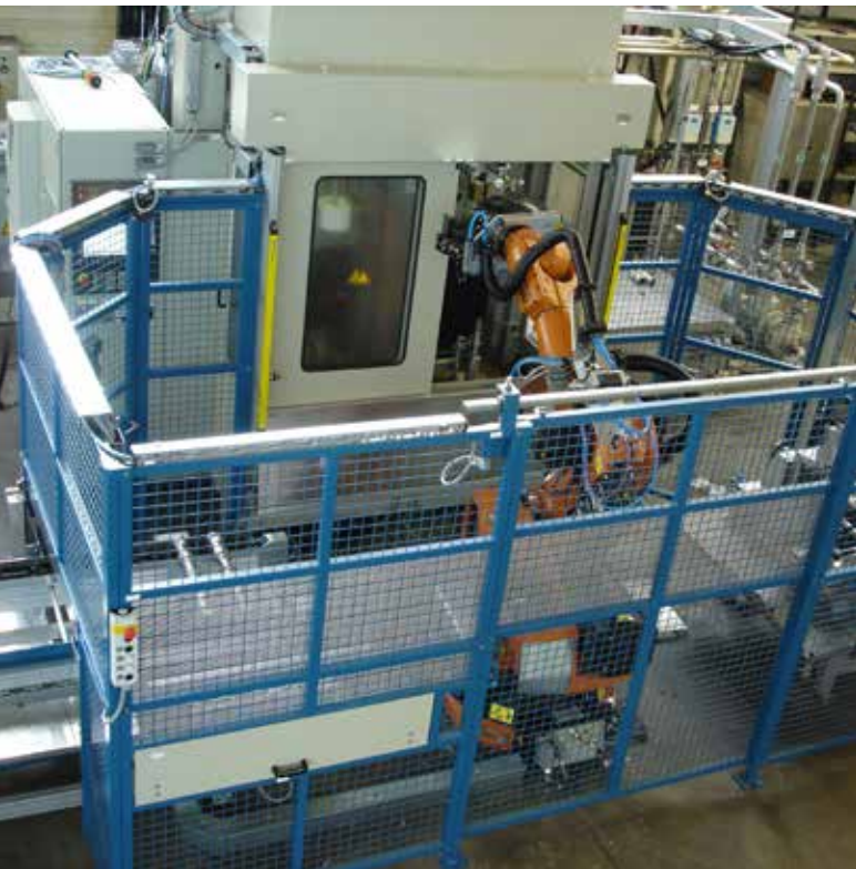
Boosting productivity: an EFD Induction HardLine vertical hardening machine with automated handling.

HardLine is EFD Induction's family of heat treatment systems for surface- and through-hardening.