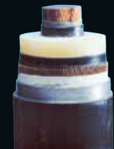
Pre/post heating. Curing of insulation around wires. Manufacturing of optical fiber cable.