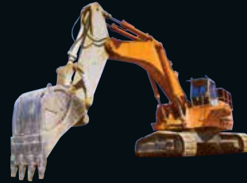
Hardening and tempering of transmission and engine parts (shafts, valves, etc.). Straightening during repairs.