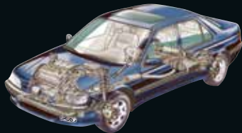
Hardening and tempering of engine and trans- mission parts. Curing of paint and brake-disc coatings. Bonding of body parts. Tube welding of exhaust pipes. Brazing of components. Magnet bonding in electric motors.