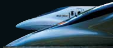
Disassembly and shrink-fitting of wheel rings and bearing rings. Brazing of copper compo- nents. Straightening.