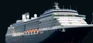
Hull straightening during construction. Straight welding of beams in double hulls. Paint removal. Brazing of copper compo- nents. Hardening of large gears, winches and chains. Heat treatment of shafts. Pre-heating of valves prior to welding.