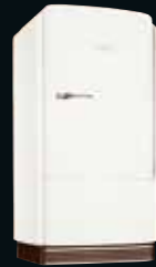
Brazing of compressor parts. Bonding of fridge bodies. Paint curing. Tube welding.