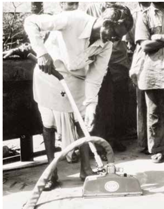
EFD Induction equipment has been used and trusted around the world for decades. This 1986 snap shows employees of Garden Reach Shipbuilders and Engineers Ltd. in Calcutta, India, testing their new ELVA TERAC 16 induction heating machine. The system was used for straightening ship hulls.

More than half a century after that first hardening machine left the workshop in Freiburg, our enthusiasm for induction heating burns as bright as ever. If you're curious about what it might mean for the productivity of your company, give us a call. Induction heating is our passion. We'd like to share it with you.