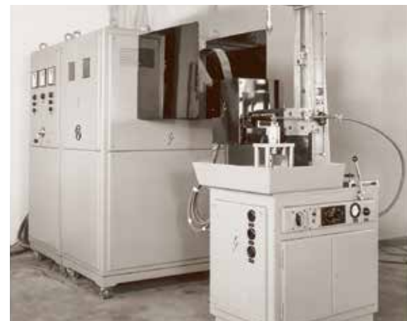
The pioneer—FDF's first universal hardening machine awaits shipping in late 1950.

Expansion was swift. One key step was the acquisition in 1998 of Grenoble-based CFEI. A veteran induction heating company, CFEI was the market leader in France. Particularly strong in devising hardening solutions for