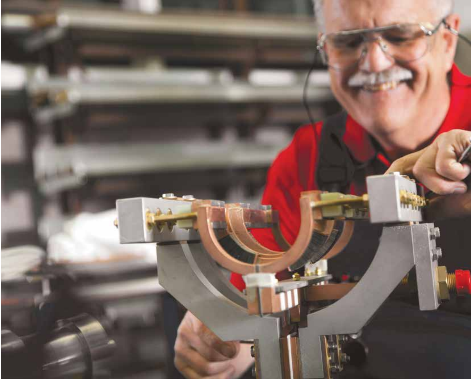
EFD Induction has years of experience designing and supplying customized, long-life coils for the full spectrum of applications and materials.