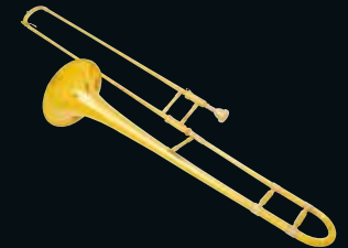
Brazing and soldering of brass parts.