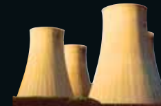
Brazing of copper parts in generators. Shrink- fitting. Bolt expansion. Pre/post heating and brazing for high-pressure turbines.