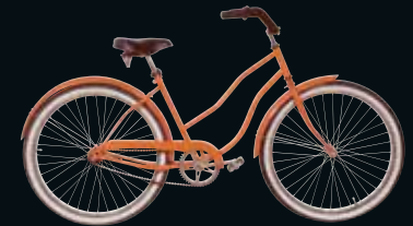
Hardening and brazing of components. Welding of frame tubes.