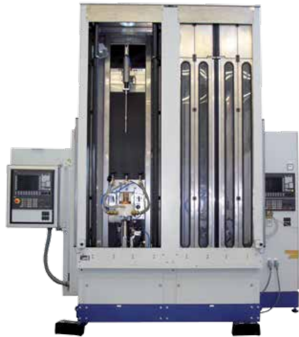
A twin cabinet EFD Induction vertical hardening machine. The power source is an EFD Induction Sinac.

To learn more about our camshaft hardening systems—and our experience with demanding customers—just contact your nearest EFD Induction office. Full contact details can be found at: www.efd-induction.com