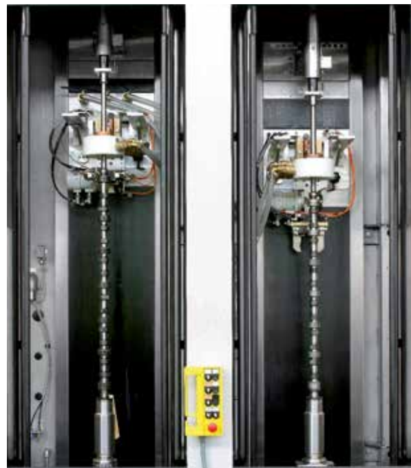
Above, a double station EFD Induction vertical hardening machine in action. Left, simultaneous quenching with polymer emulsion of two camshaft lobes.