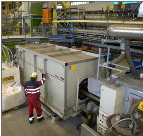
A serial-compensated medium-frequency Sinac at work preheating industrial components.

Sinac is available as standard or custom-made systems. But whichever you choose, Sinac will help boost quality, increase throughput and lower costs. If you'd like to know how, just give us a call today. Our reference library has dozens of cases on file where Sinac has achieved these goals. A Sinac system could have a big impact on your business. We'd like to show you how.