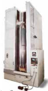
HardLine® Industrial heat treatment systems