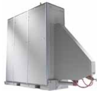
Weldac® High-output solid-state welders