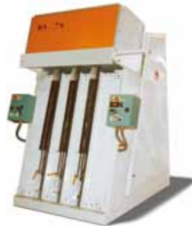
HeatLine® Industrial heat processing systems