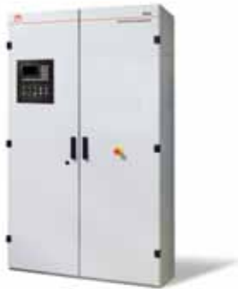
Sinac® Universal heat generators

EFD Induction also develops, commercializes and supplies mechanical handling equipment, coils and software control systems. We also offer a comprehensive, worldwide service program. To learn more about EFD Induction—and how we can help your business—please contact your nearest EFD Induction office.