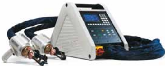
Minac® Mobile heat generators