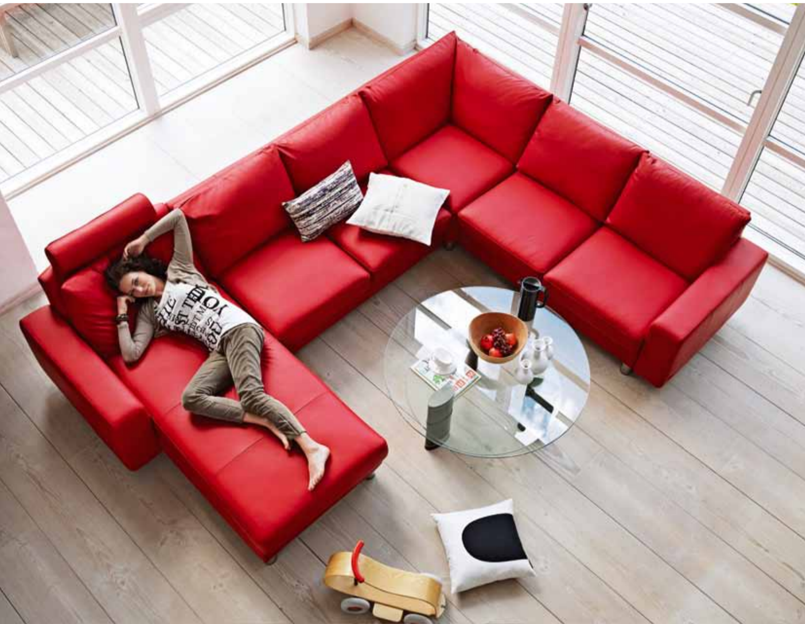
A Stressless E200 sofa, just one of the wide range of armchairs and sofas manufactured by Ekornes.