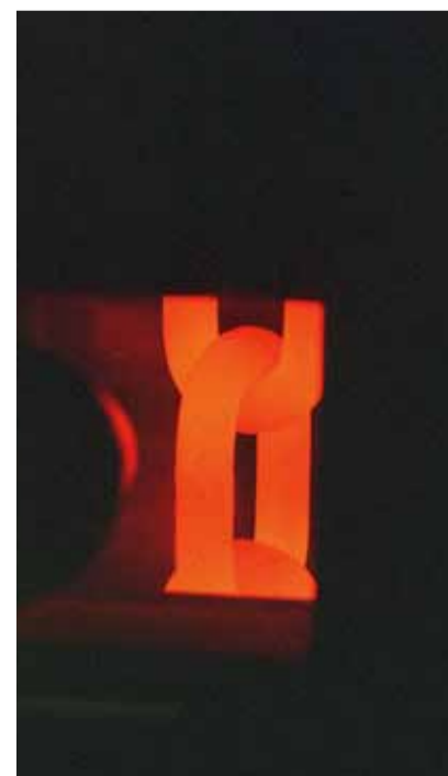
One of the orders will be the world's largest induction heat treatment line for chain.