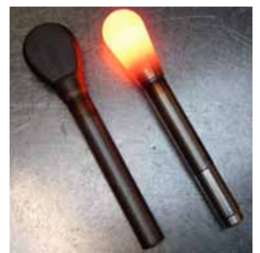
Right: a rigging component heated by induction. Left: after hot forging.