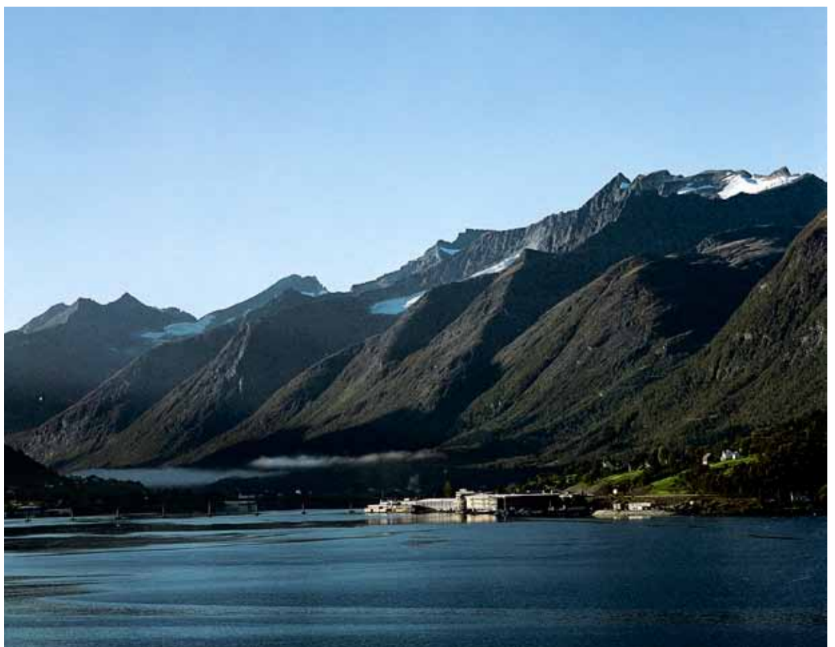
Dramatic home for relaxing products: Ikornnes in western Norway, base for the corporate HQ of Ekornes.

Ekornes is the largest furniture manufacturer in the Nordic countries, and owns the world famous "Stressless" brand of sofas and recliners. The company also produces "Svane" brand beds. In fact, Svane was the first trademark to be registered in the Norwegian furniture industry. Find out more at: www.ekornes.com