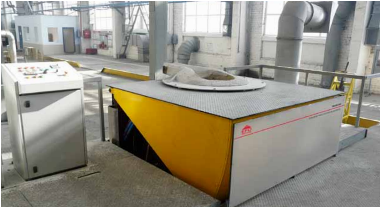
A new 1,200 kg-capacity FIB furnace being installed at a bearing manufacturer's facility.

offer a full range of maintenance, logistics, training and spares services. Make the most of your heating system—with a little help from the people who built it.