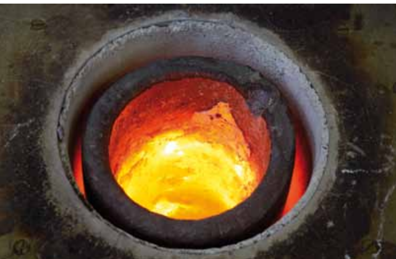
An EFD Induction furnace at work. This graphite crucible contains molten brass.

Power sources and furnaces are only part of the complete customized melting solutions available from EFD Induction. We can for instance help with computerized simulations of various technical solutions, as well as detailed cost-benefit analyses of different investment strategies. And of course, as one of the world's leading induction companies, you can rely on our training and maintenance services to help maximize your furnace's productivity.