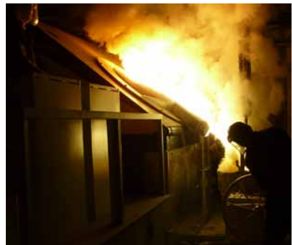
FIB is our range of single-axis tilting furnaces. The FIB coreless (shown here) features an innovative coil design that maximizes efficiency.