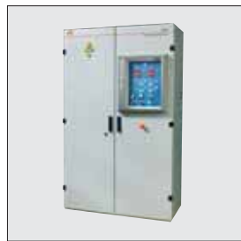
Sinac Heat Generator

Developing customized hardening solutions is an EFD Induction specialty. In fact, custom-engineered systems account for almost half of our hardening machines. Areas of particular expertise are the design and production of laser hardening and drum (Trunion) systems. We also design and supply in-line transfer and conveyor systems for complex components with multiple hardening and tempering zones.