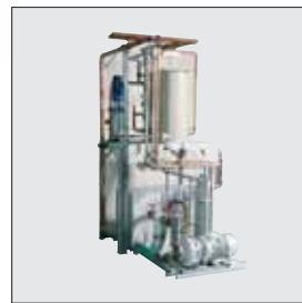
Cooling and quench system