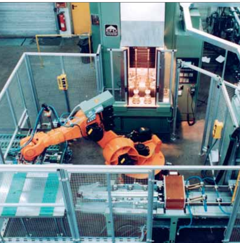
Boosting productivity: an EFD Induction HardLine vertical hardening machine with automated handling.

HardLine is EFD Induction's family of heat treatment systems for surface- and through-hardening.