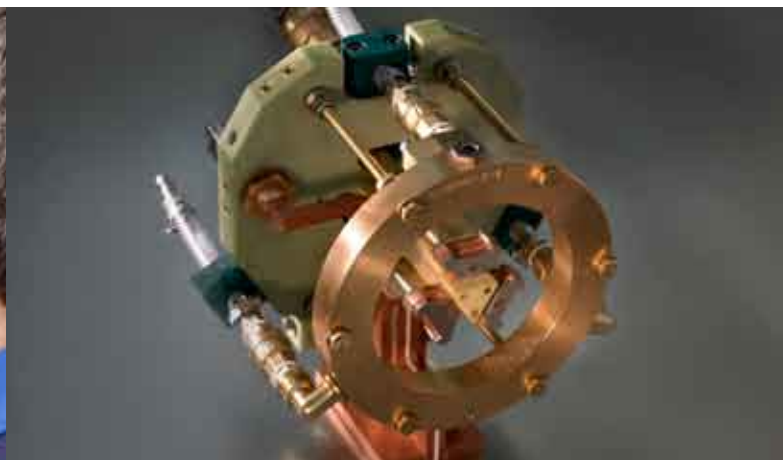
Inductor for surface hardening of tripods. The inductor head is equipped with magnetic flux controllers, main quench and screen quenches.