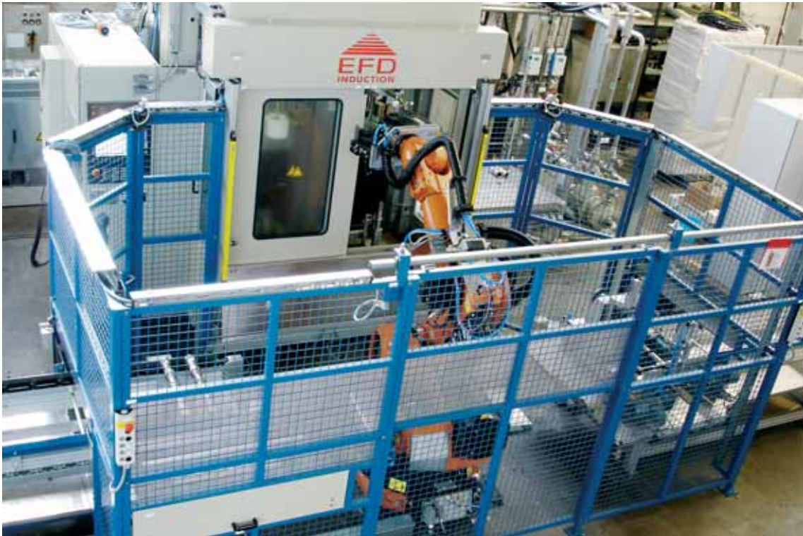
Many HardLine vertical machines are customized to work with robotic handling solutions. Above, a HardLine machine and its robotic handling system near completion at the EFD Induction factory in Freiburg, Germany.

When you choose a solution from EFD Induction you choose security and peace-of-mind. As one of the world's largest induction heating companies we offer a full range of maintenance, logistics, training and spares services. Make the most of your heating system—with a little help from the people who built it.